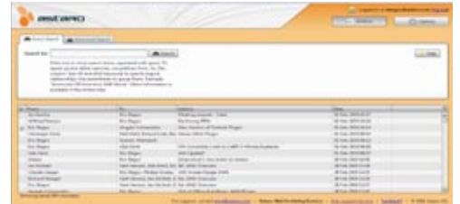
Find e-mails in seconds